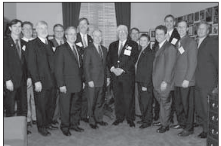
Members of The Alabama Council AIA attended Grassroots in Washington, DC, and met with Senator Sessions.