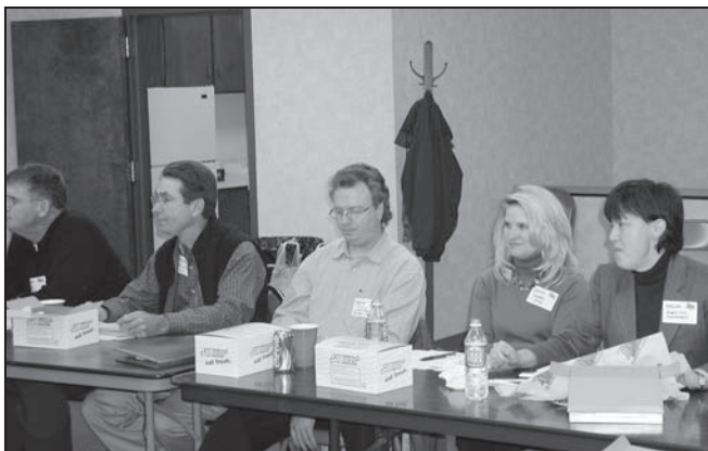
Working Together: Alabama Council members met with members of the ACEC and ABC boards.