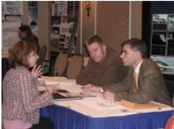
The Chapman Sisson firm interviews a student at the AiAS internship fair in January.

We are currently updating our mailing database to ensure every firm knows about the event in a timely