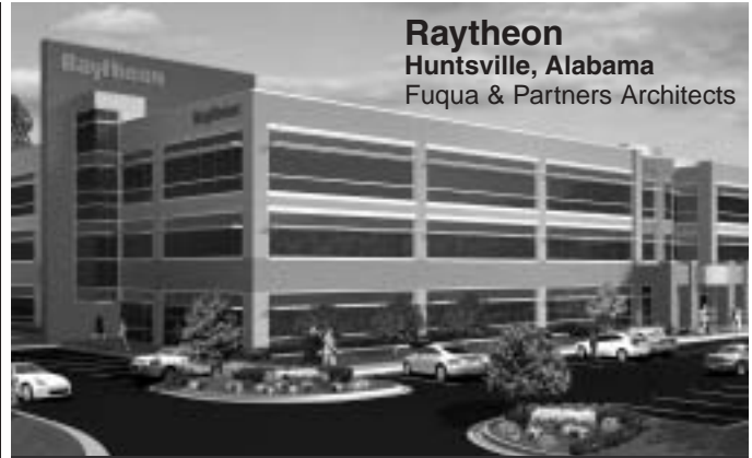
Raytheon Huntsville, Alabama Fuqua & Partners Architects

More information on convention activities and speakers will be mailed soon. Make your room reservations soon!