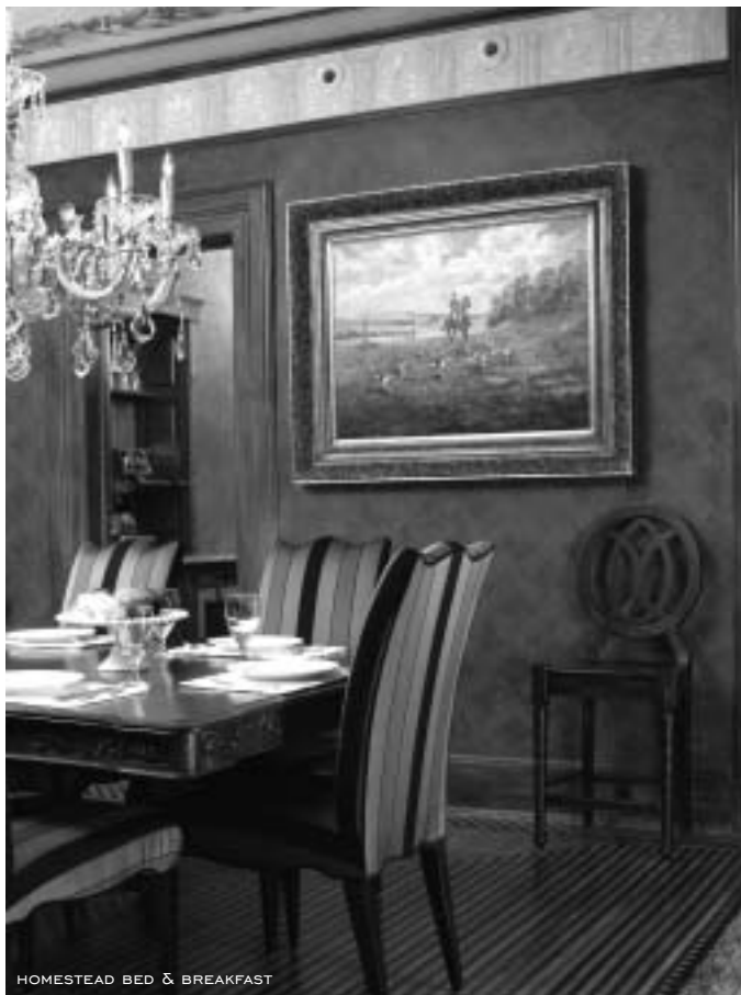
HOMESTEAD BED & BREAKFAST

Also, the School of Architecture is putting a greater emphasis on community service. The architecture thesis students were required to complete a number of community service hours as a part of their coursework. AiAS and other student organizations continue to provide opportunities for students to work with Alabama Rural Ministries and Habitat for Humanity. DesignHabitat II is working on hurricane relief housing in a vertical studio this semester. While the Design-Build masters' students developed an economical housing system out of shipping containers last fall. Our Rural and Urban Studios continue their outreach work as the school seeks to give every design student the opportunity to serve the community.