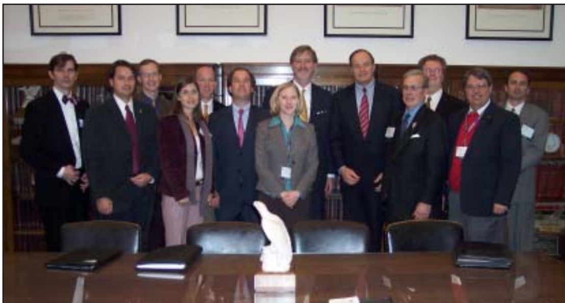
Members of The Alabama Council AIA attended Grassroots in Washington, DC, and met with Senator Shelby.

• Hurricane Rebuilding: AIA supports legislation that would stabilize the economy and ensure redevelopment of areas within Louisiana and Mississippi that were devastated by Hurricane Katrina or Hurricane Rita.