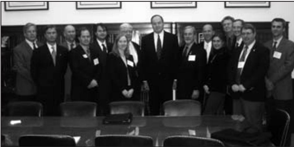
Senator Shelby and Alabama Council AIA members at Grassroots in February.

Reps. Stephanie Tubbs Jones (D-OH) and Phil English (R-PA) reintroduced the Community Restoration and Revitalization Act on February 15th with 24 original cosponsors; the bill now has a total of 43 cosponsors. From Alabama, cosponsors include Jo Bonner, Bud Cramer and Artur Davis. Eight other members of the committee have also signed on. At the same time, Sens. Blanche Lincoln (D-AR), Gordon Smith (R-OR), and Mary Landrieu (D-LA) introduced a Senate version of the same bill, S.584 . Senators Joe Lieberman (I-CT) and Kay Bailey Hutchison (R-TX) are also cosponsoring the bill.