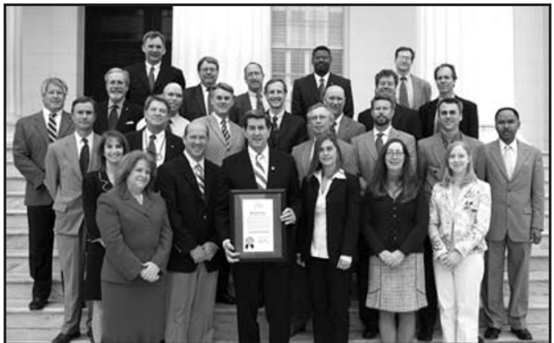
Governor Riley and Alabama Council AIA members pictured on AIA Day in April.

Design excellence is the foundation of successful and healthy communities.